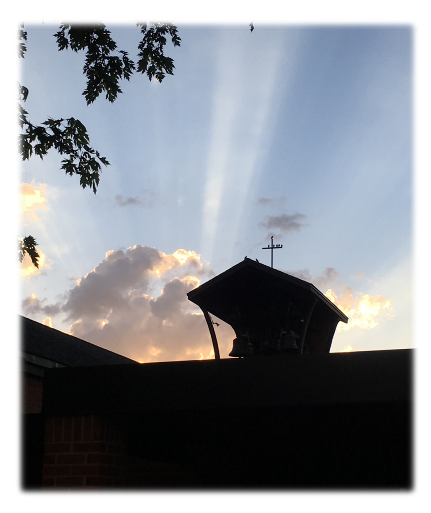
The Twenty-Fifth Sunday after Pentecost Sunday, November 19, 2023 • 10:00 AM Rite II