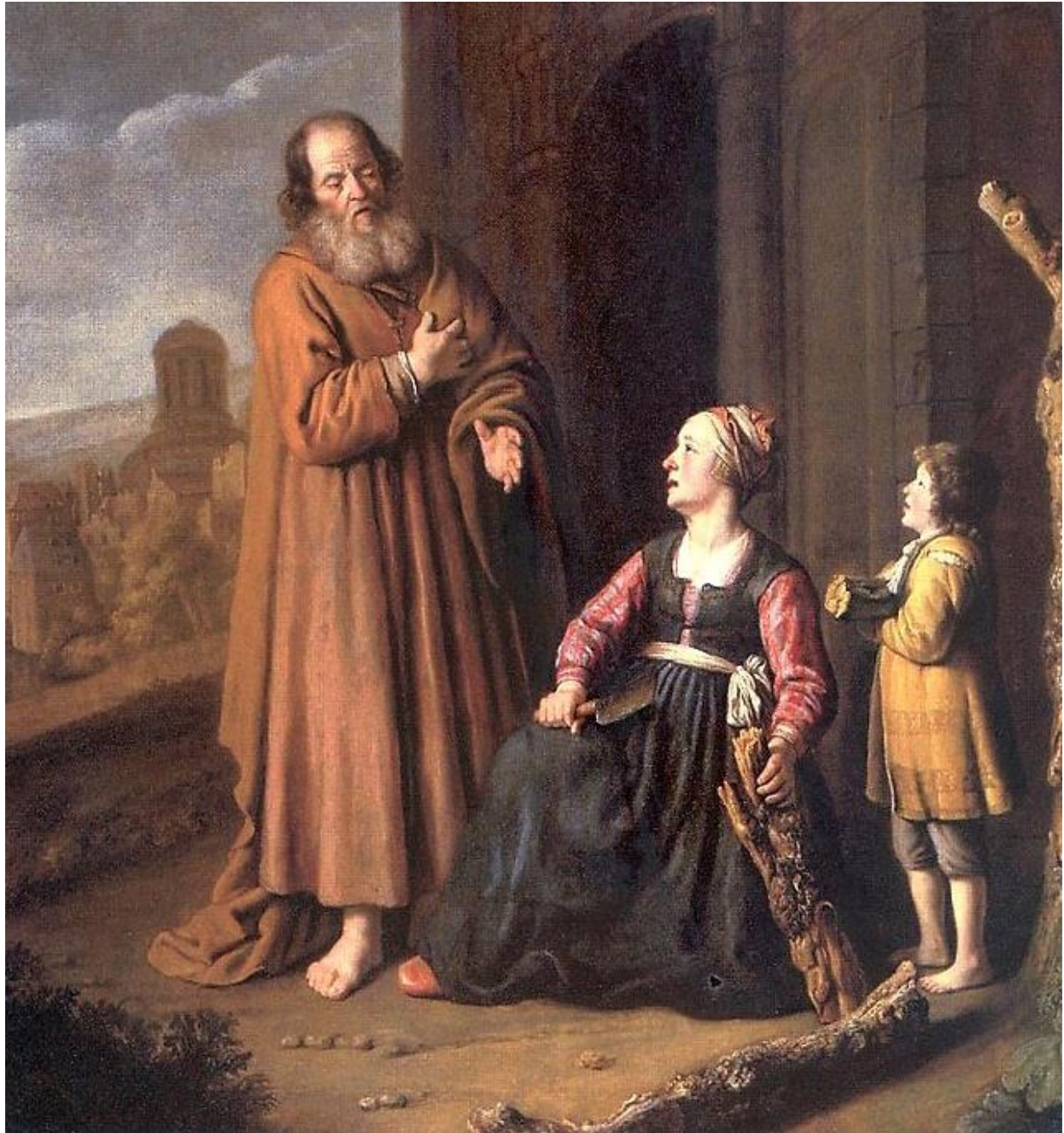
Elijah and the Widow of Zarephath, Jan Victors Museum of John Paul II Warsaw, Poland