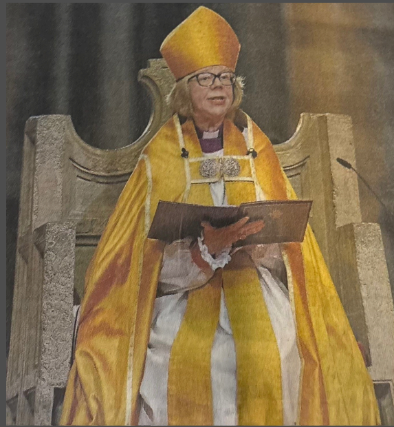
Sarah Mullally, installed as first female Archbishop of Canterbury on 3/25/26

Most mornings, I wake up to enjoy a hot latte, and catch up with my Wall Street Journal. On Thursday, March 26th, I was inspired by the WSJ Headline article “Anglicans Install First Woman Head”. Sarah Mullally is the 106 th Archbishop of Canterbury, and the first woman to be appointed in the more than 1,400-year history of the office in the Church of England.