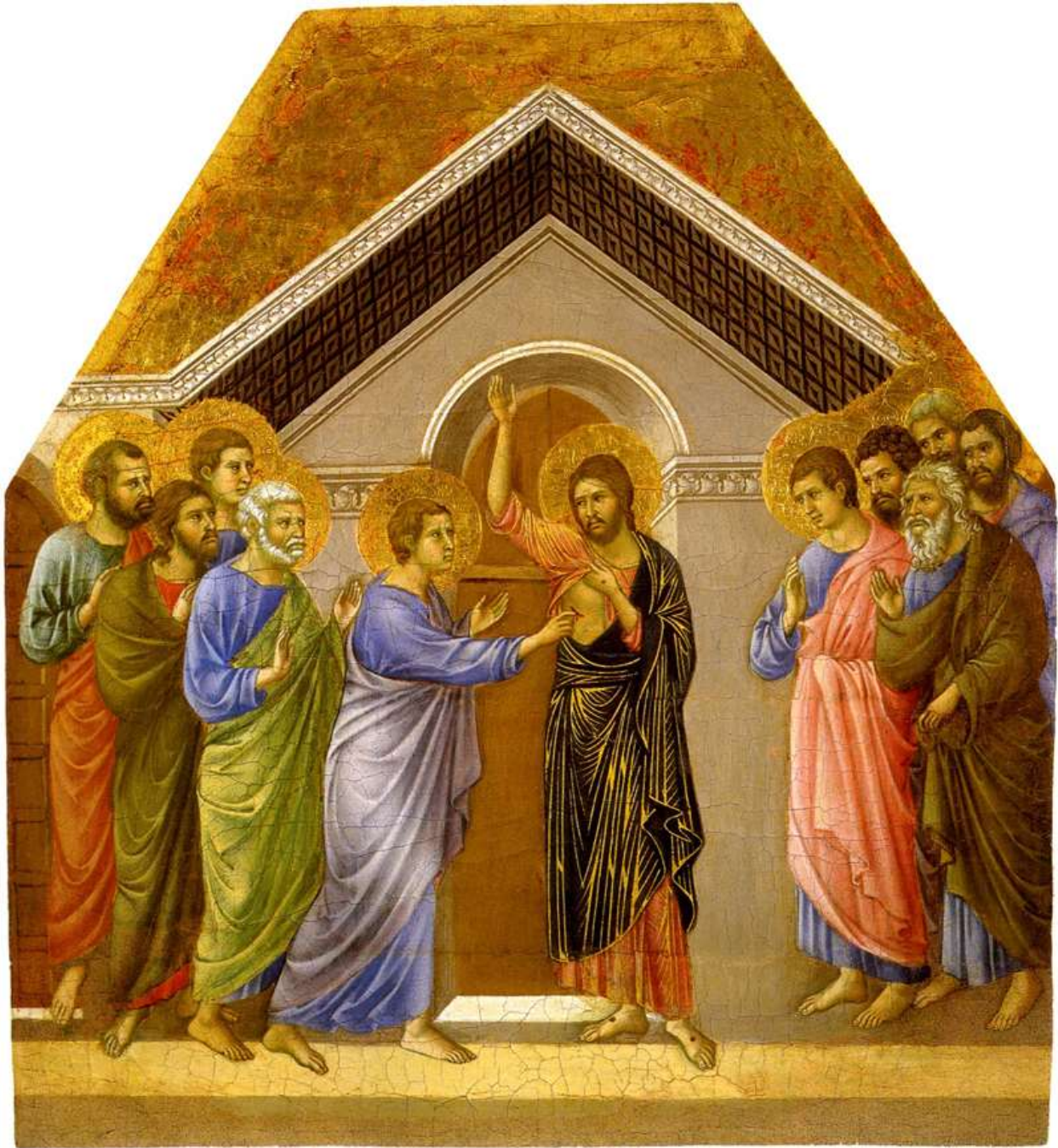
Duccio, di Buoninsegna, -1319?. The Incredulity of Thomas