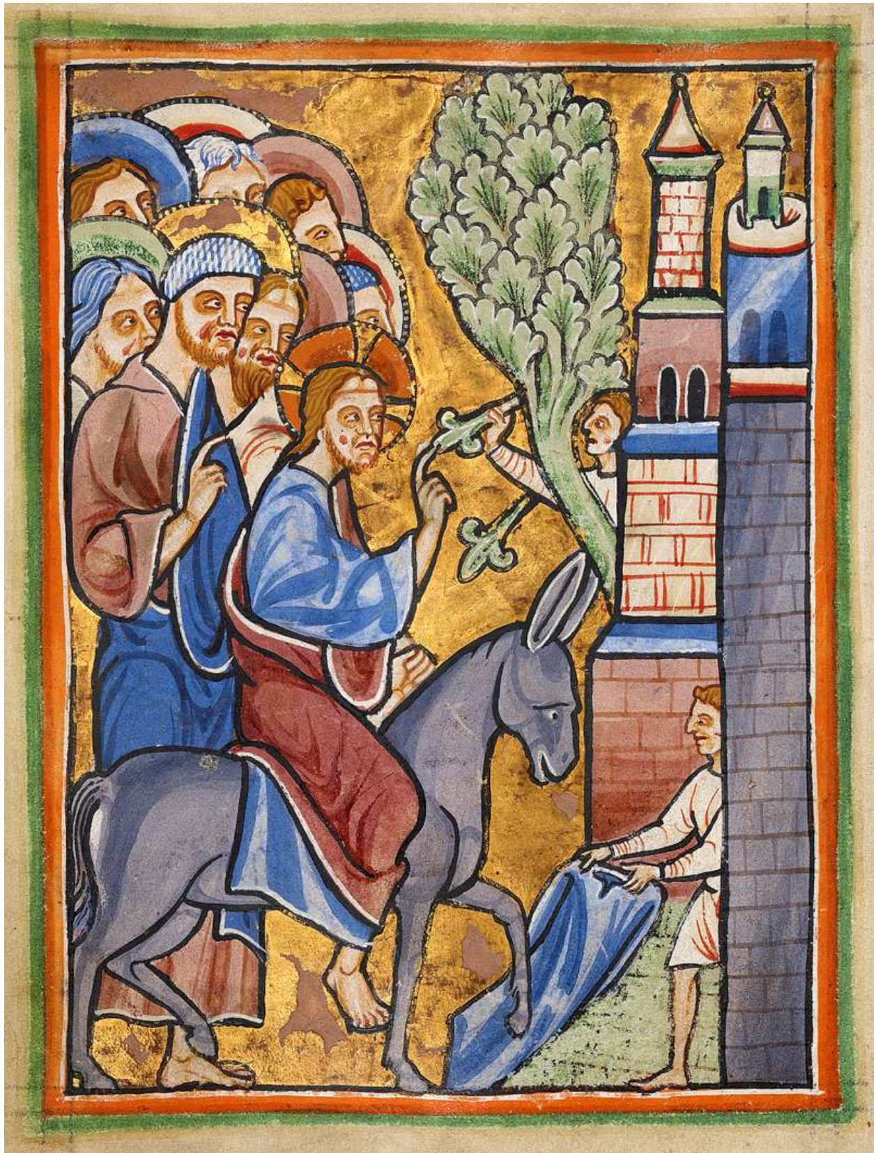
Entry into Jerusalem

The Sunday of the Passion: Palm Sunday Sunday, March 29, 2026 • 10:00 a.m. Rite II