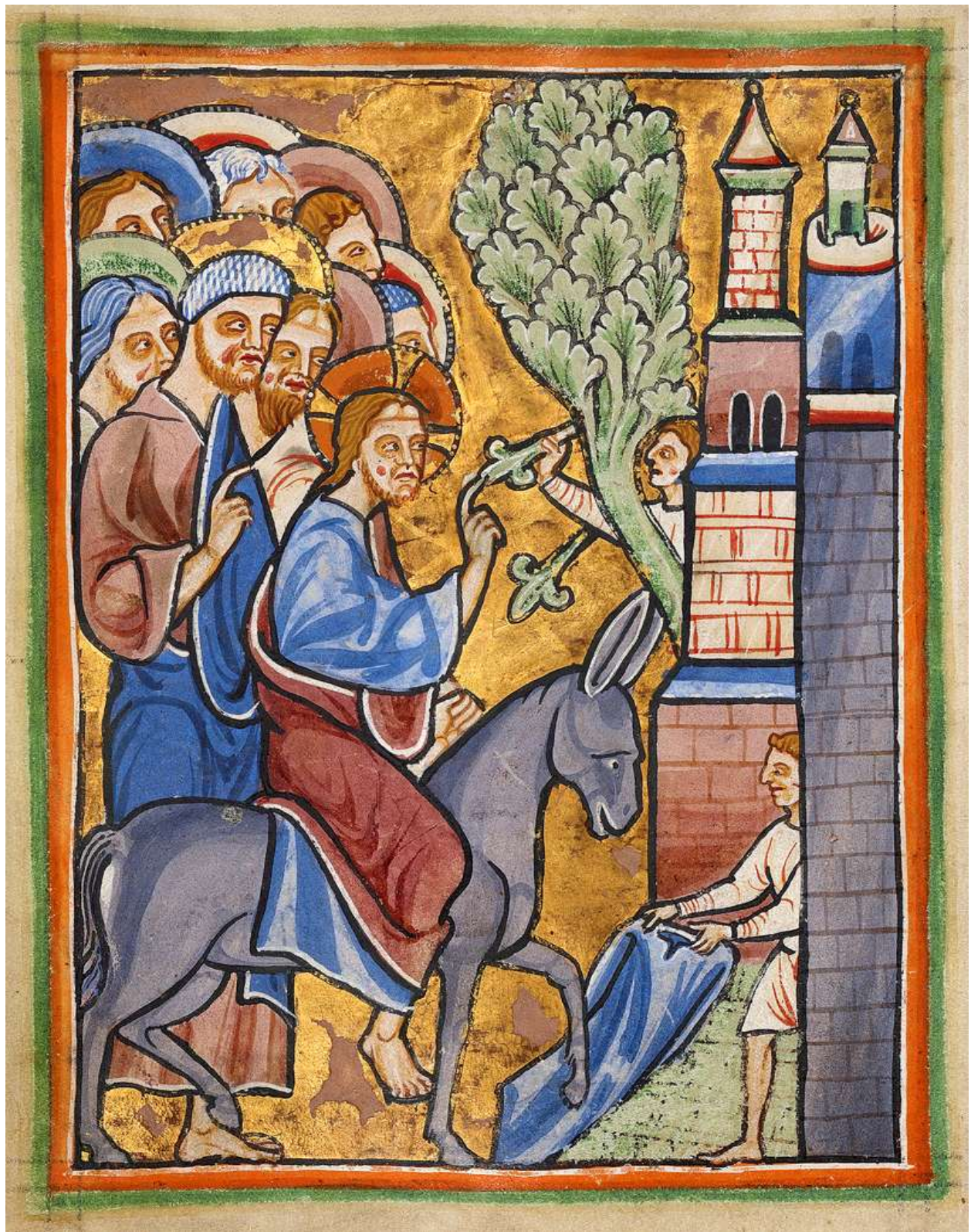
Entry into Jerusalem, from Art in the Christian Tradition , a project of the Vanderbilt Divinity Library, Nashville, TN. https://diglib.library.vanderbilt.edu/act-imagelink.pl?RC=57329 [retrieved March 24, 2026].

The Sunday of the Passion: Palm Sunday Sunday, March 29, 2025 • 8:00 a.m. Rite I