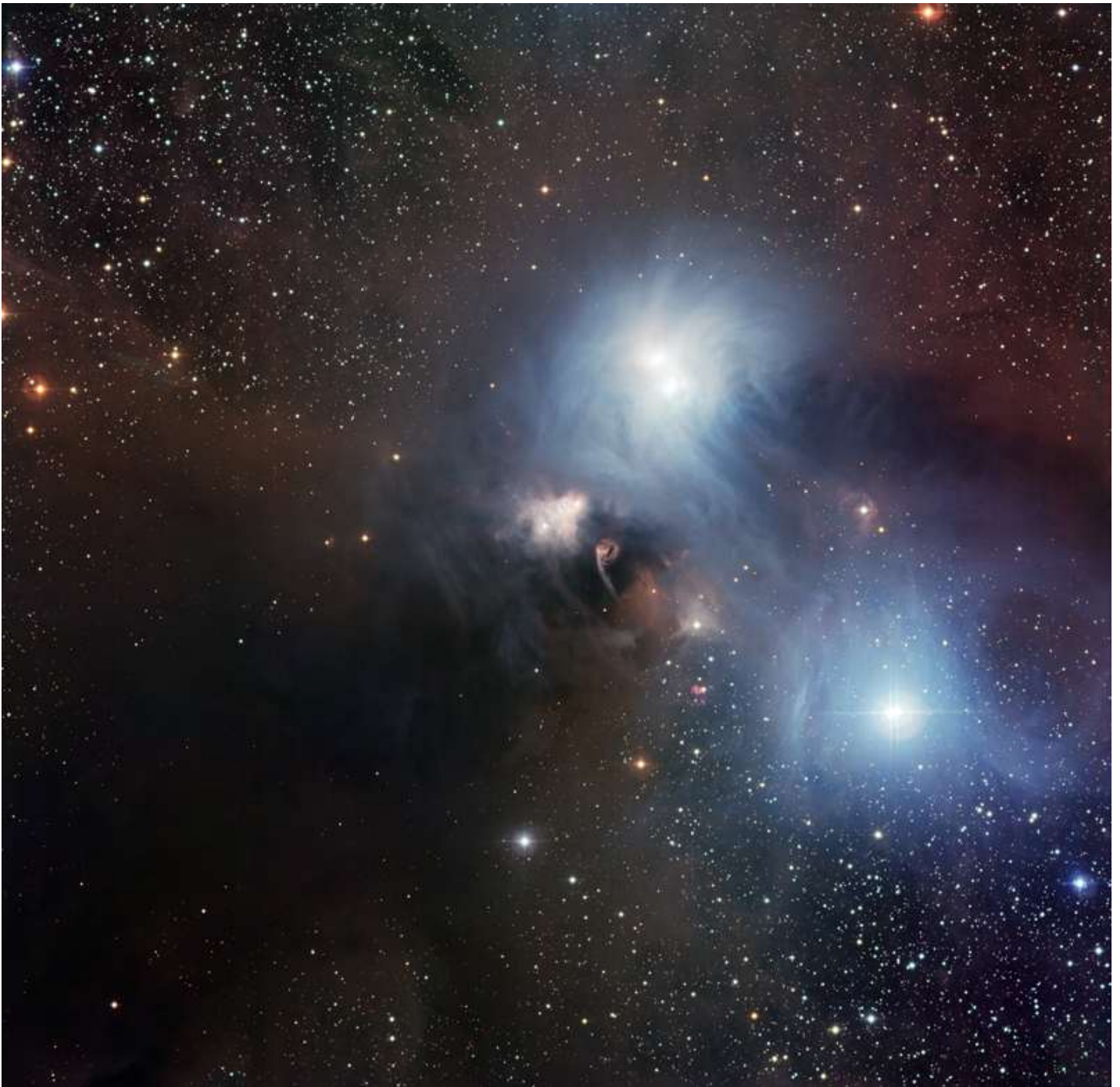
R Coronae Australis, from Art in the Christian Tradition, a project of the Vanderbilt Divinity Library, Nashville, TN. https://diglib.library.vanderbilt.edu/act-imagelink.pl?RC=55395 [retrieved December 26, 2025].