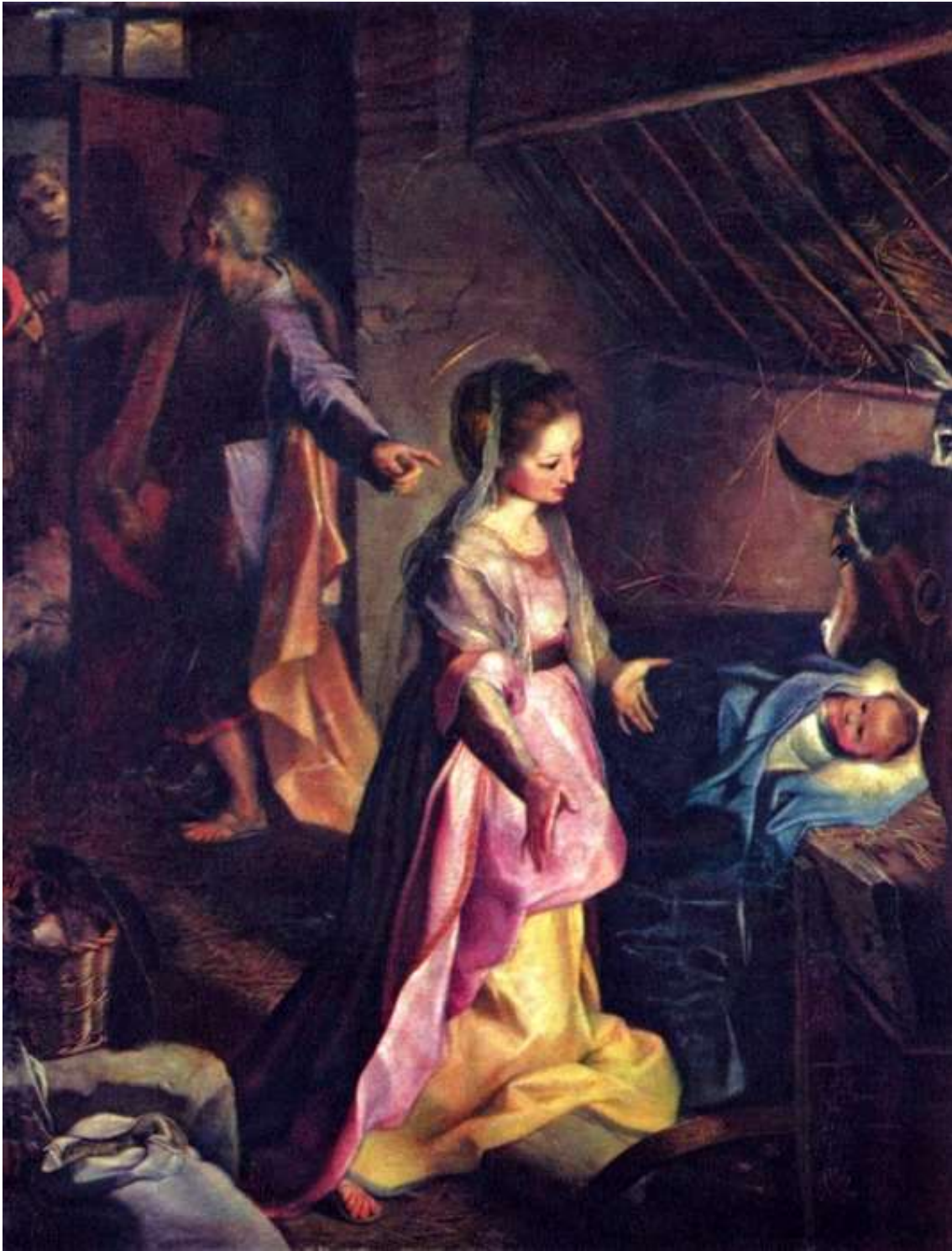
Barocci, Federigo, 1528-1612 . The Nativity, from Art in the Christian Tradition, a project of the Vanderbilt Divinity Library, Nashville, TN. https://diglib.library.vanderbilt.edu/act-imagelink.pl?RC=47418 [retrieved December 15, 2025].