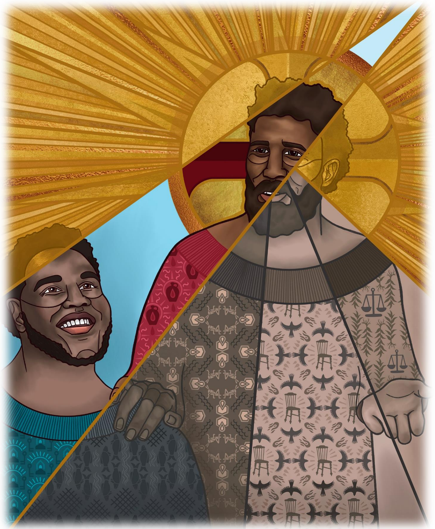
The Third Sunday in Lent Sunday, March 3, 2024 • 10:00 AM Rite II