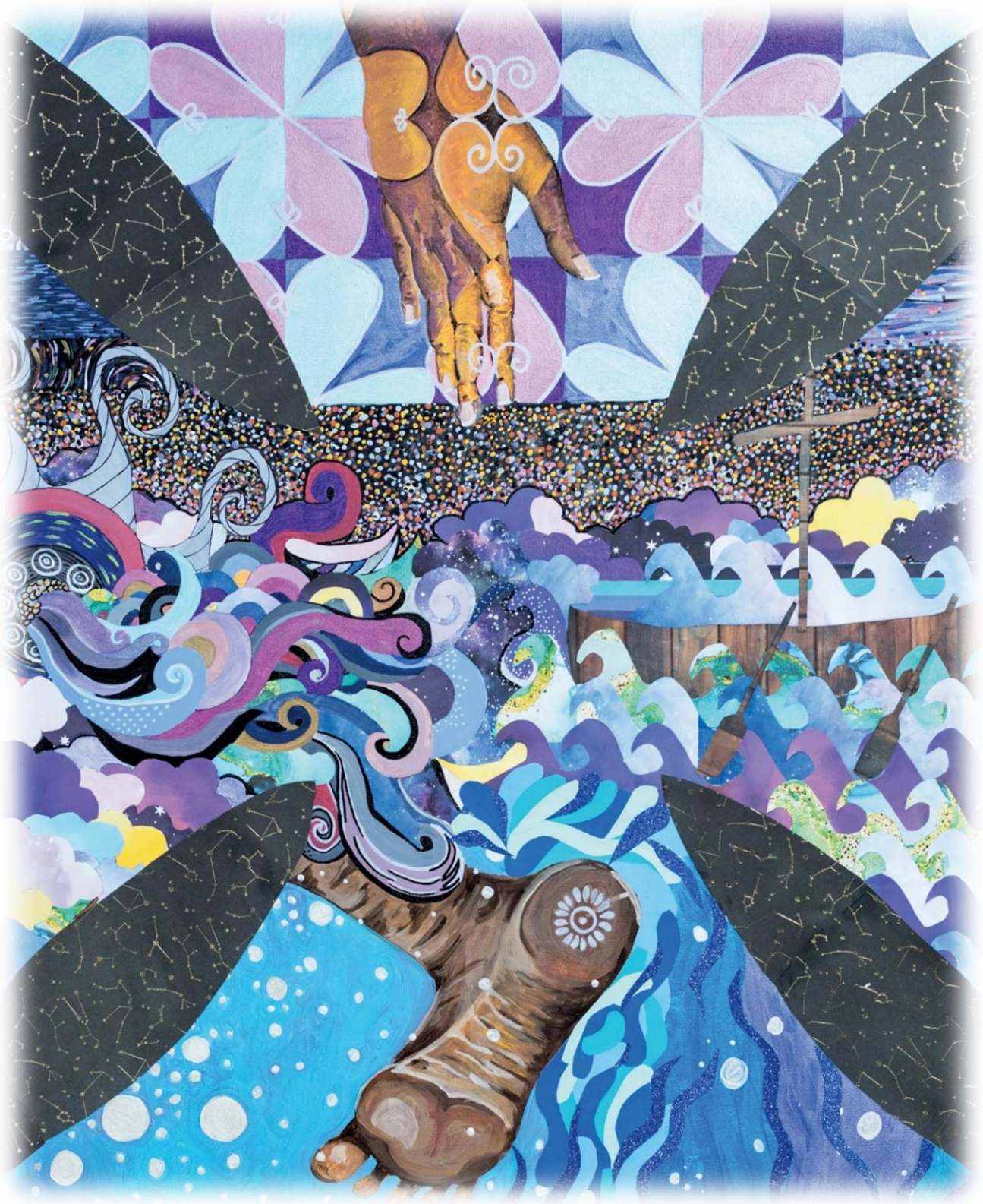
The Second Sunday in Lent Sunday, February 25, 2024 • 10:00 AM Rite II